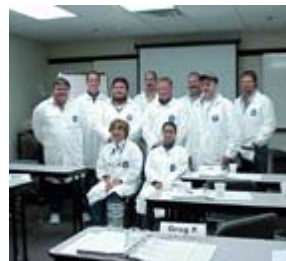
Small Class Size