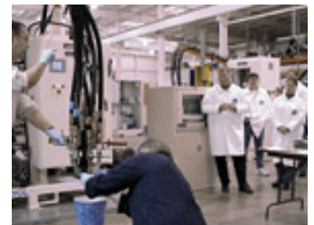
Methods of Calibration